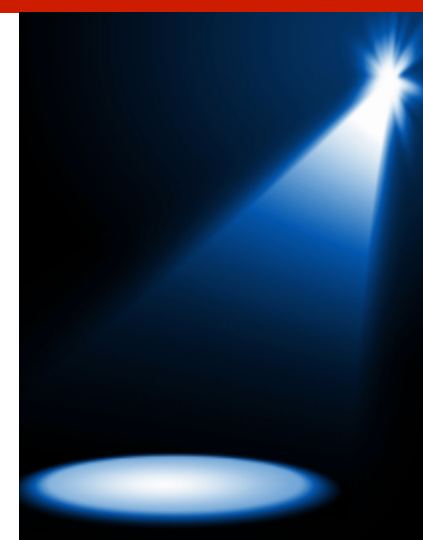
Taking the SPOTLIGHT

Executive Stories (Women-Men) - personal journey, challenges, resources, coaching, resilience to the top.